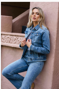
NEVE DENIM JACKET IN BLUE DENIM BY SAINT ROSE*