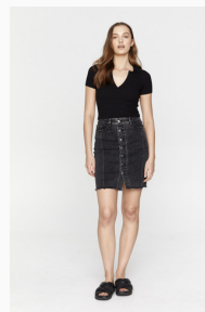
BLAIR DENIM SKIRT IN COAL BY SAINT ROSE*