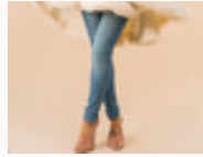
HOODED FAUX FUR TRIM PONCHO IN CREAM BY CINNAMON CREATIONS*