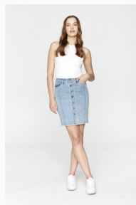
BLAIR DENIM SKIRT IN VINT BLUE BY SAINT ROSE*